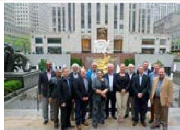
CSI Board and Committee Chairs at the Rockefeller Centre in New York City